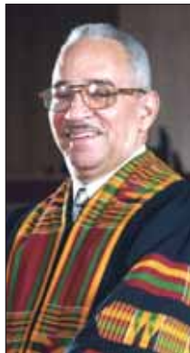
Rev. Jeremiah A. Wright, Jr. will remind delegates of the call and message of biblical prophets.

The Southern Conference starts a church growth initiative, and successful churches offer tips on what draws in new members.