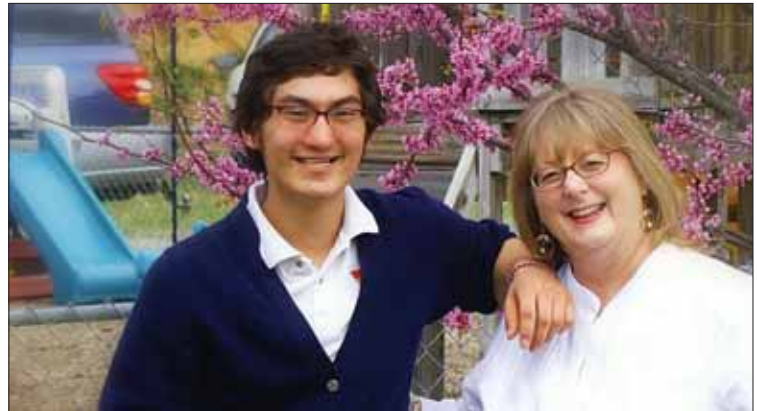
The Tsutsumi family was invited by friends to visit their church after relocating from Oregon. They officially joined High Country UCC on May 18.

The Southern Conference starts a church growth initiative, and successful churches offer tips on what draws in new members.