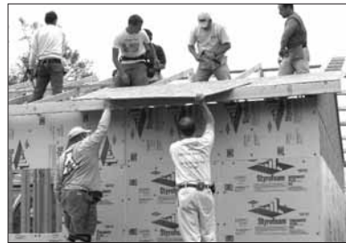
Members of Corinth Reformed Church work on a Habitat for Humanity House. The project, which was built on the church lawn and later moved to the homeowner's property is part of their connection with the Hickory community.