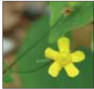
Buttercup Ranunculaceae Photographed at Johns River Valley Camp by G.L. Stumb