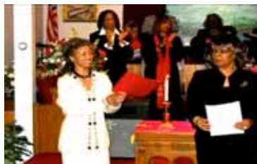
Presentation of Ordination Certificate & Bible