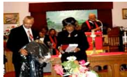
Vestments & Presentations